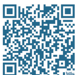
Applied qualitative methods for social life cycle assessment: a case study of Canadian beef