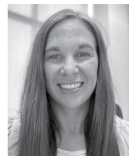
Fonda Froats Saskatchewan Ministry of Agriculture