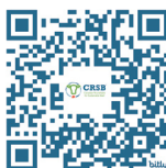
Understanding the Current State of Carbon measurement and reporting landscape