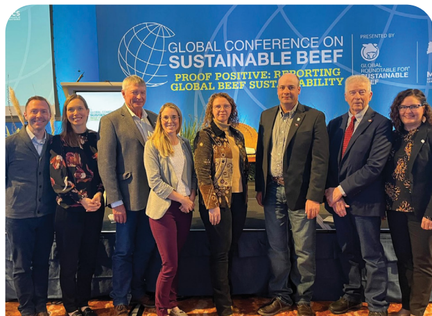
Canadian delegation at the Global Conference on Sustainable Beef in Punta del Este, Uruguay.

CRSB staff and leadership joined a delegation of eight Canadians representing various organizations to attend and actively participate in the Global Conference on Sustainable Beef.