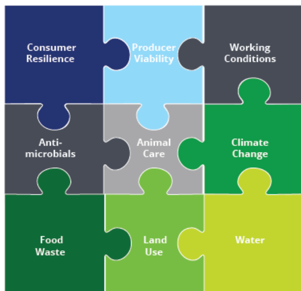
Figure 3: Key sustainability focus areas for continuous improvement

This report highlights nine focus areas for continual improvement under each pillar of sustainability (Figure 3). Focus areas were selected based on hotspots identified in the baseline assessment as well as through membership priority setting.