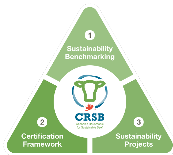
Figure 1: CRSB's core areas of work

The CRSB will review the NBSA and Strategy approximately every five years, both to evaluate industry's progress over time as well as re-set and further refine the goals based on newly available data and methods.